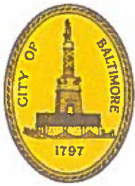
Catherine E. Pugh Mayor