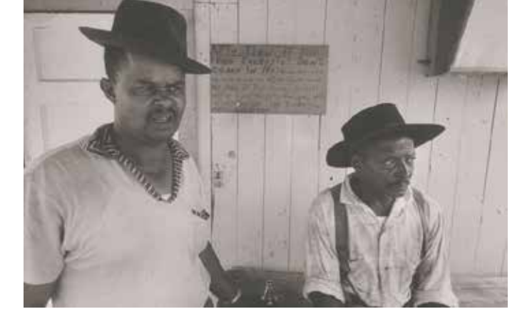
Labor organizers in the 1950s exposed widespread abuses of migrant farmworkers.