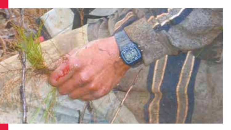
Guestworkers perform some of the most difficult and dangerous jobs in America, but many who are injured face insurmountable obstacles to obtaining medical treatment and workers' compensation benefits.

put guestworkers at an enormous disadvantage in obtaining benefits to which they are entitled. As a practical matter, workers also have an extremely difficult time finding a lawyer willing to accept a case for a guestworker who will be required to return to his or her home country. In 2003, a group of civil rights and immigrant rights groups filed an amicus brief with the Inter-American Court of Human Rights relating to the treatment of immigrants in the United States. Among their many complaints: the discrimination against foreign-born workers in the state-by-state workers' compensation scheme. That brief states: