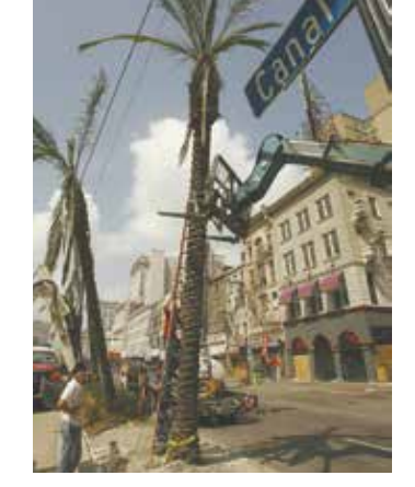
Guestworkers recruited from Bolivia, Peru and the Dominican Republic each paid between $3,500 and $5,000 to obtain temporary, low-wage jobs in New Orleans hotels after Hurricane Katrina. The hotel owner certified to the U.S. government that no American workers were available.

recruitment activities in a variety of H-2 occupations, including the seafood, <sup>28</sup> herder,<sup>29</sup> and agriculture<sup>30</sup> industries, among others.