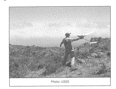
The Qube Weight: 5.5 pounds Length: 3 feet Endurance: 40 minutes* Range: 1 kilometer*

Legislation passed last year requires the FAA to safely integrate UAS into the U.S. national airspace system (NAS) by 2015. Public safety agencies may only fly UAS if they have received a "Certificate of Authorization," or COA, from the FAA and COAs clearly outline when, how and where these small UAS may fly. They must be flown within line of sight of the operator, below 400 feet and only during the daytime. Below are a few examples of small UAS used by public safety agencies: